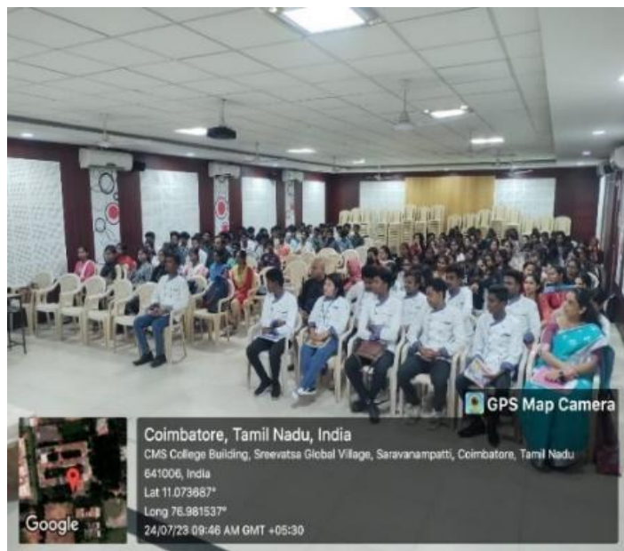
Value Added Program

The institution's emphasis on modular courses, along with specialized programs like Value Added Programs (VAP), Entrepreneurship Development Cell (EDC), Innovation and Design Cell (IDC), and Placement Assistance, enriches the learning journey, equipping students with practical skills and industry-relevant knowledge.