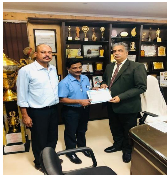
BLOOD DONATION CAMP AT CMS COLLEGE